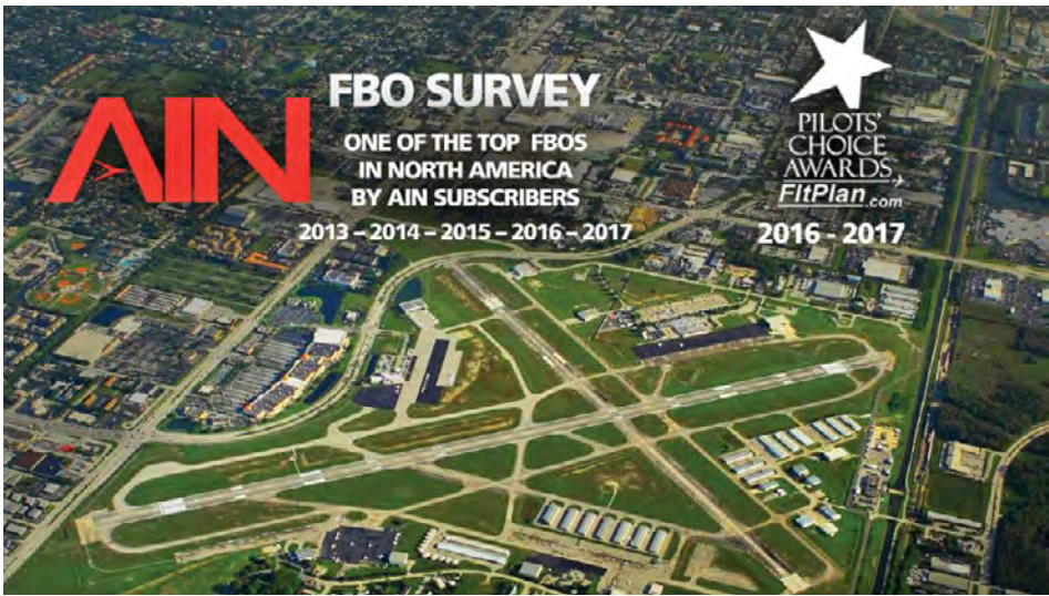
ABOVE: An archive photo boasting similar wins for Page Field featuring an aerial shot of the local airport.