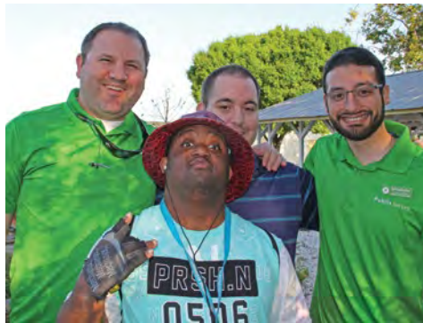
TOP & LEFT: A huge turn out of Publix employees volunteering United Way on Publix Serves Day at LARC in Fort Myers.

The United Way’s Day of Caring is a year-round program, coordinated by the United Way Volunteer Center which matches businesses’ desire to help with the needs of the community. Many local groups and companies have participated such as Lee Health, Chico’s, and FineMark National Bank. The United Way Volunteer Center connects individuals and companies to volunteer opportunities throughout our community. The United Way Volunteer Center also manages the Family Mentor Program, ReadingPals, and VITA. You can reach the United Way Volunteer Center by calling (239) 433-7567, or by visiting the United Way website at www.United-WayLee.org .