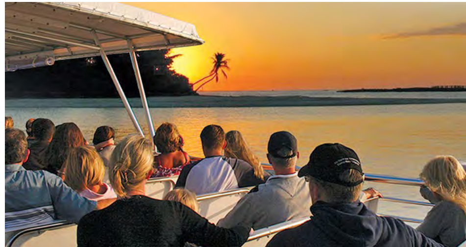
ABOVE: A full Pure Florida sets sail in Southwest Florida to take in the stunning sunset views.

FORT MYERS & NAPLES, FL - Pure Florida’s Fort Myers location will celebrate Mother’s Day Sunday, May 12 by offering moms free cruises aboard all sight-seeing cruises when accompanied by a full-fare paid adult or child admission.