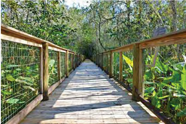
LEFT: While celebrating Earth Day, don't forget to enjoy Ah-Tah-Thi-Ki Museum's mile long boardwalk through Florida's Big Cypress Reservation!

Earth Day Celebration activities are included in the cost of admission. Please visit the museum's website - www.ahtahtthiki.com/programs - for the most up-to-date information or call Education Coordinator Alyssa Boge at (863) 902-1113, ext. 12225.