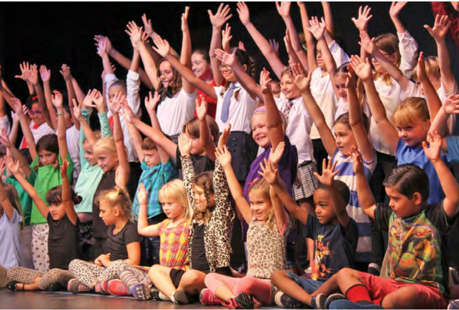
ABOVE: Last summer plenty of children had an ARTrageous time on & off the stage! Help keep your kids busy & active this summer by engaging the arts.

Venture down the rabbit hole, through the looking glass and into the world of surrealism. Enjoy a whimsical week of dilly-dallying with Salvador Dali and share the stage with madcap characters as we journey to Wonderland!