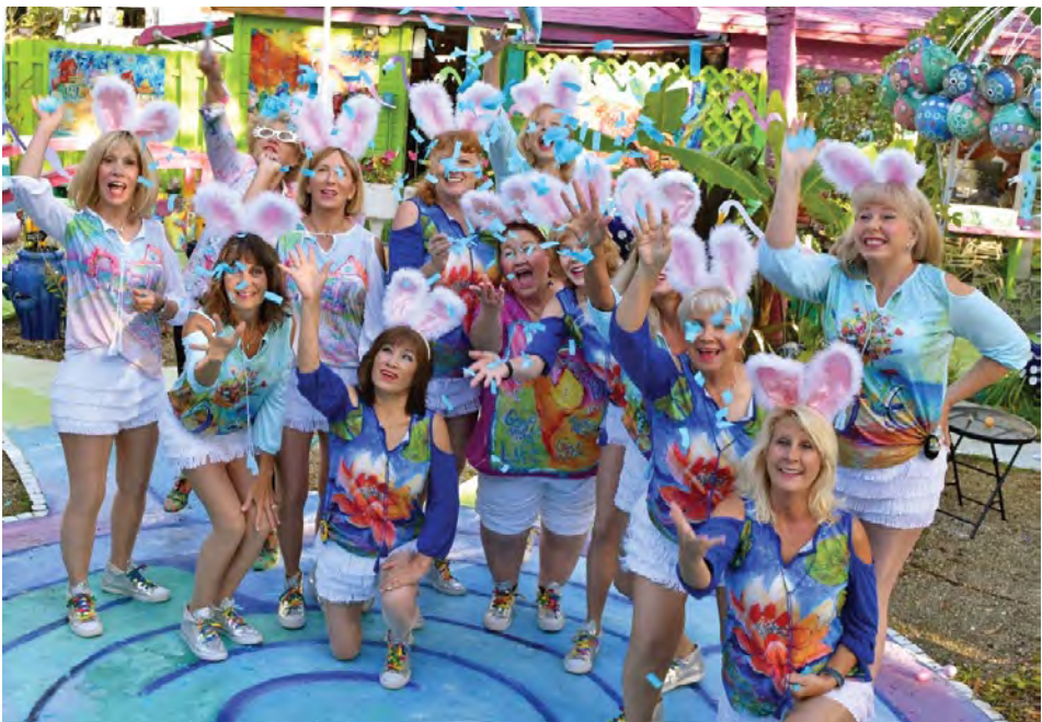
ABOVE: Members of Hot Flashz celebrate Easter 2018 island-style in Matlacha, Florida

To raise funds for Camp Boggy Creek and Special Operations Warrior Foundation the Hot Flashz will have the following public events in May: