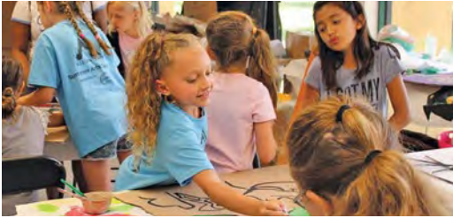
LEFT: Registration is still open! Save your kid(s) a spot now by visiting: www.artinlee.org/education/summercamp

Make a splash in the Lost City of ARTlantis! Dive beneath the waves to explore the magic of water and get inspired by what's found under the sea, from real and imagined ocean wildlife, to submarines and shipwrecks. Swim on to center stage for an aqua adventure unlike any other!