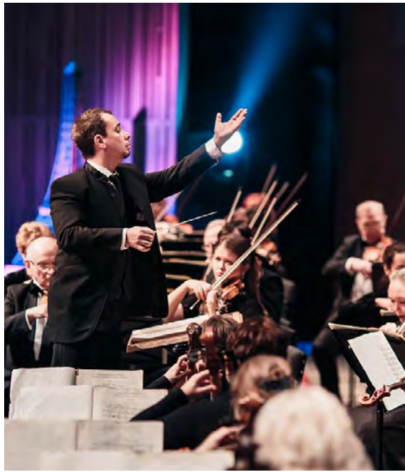
ABOVE, LEFT: Two opera performers take stage in Verdi’s “La Traviata”, when live, they are joined by a 50 piece orchestra and an accompanying choir of 40 singers.