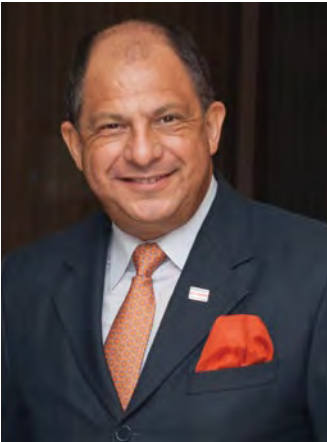
ABOVE: Former President of Costa Rica, Luis Guillermo Solis