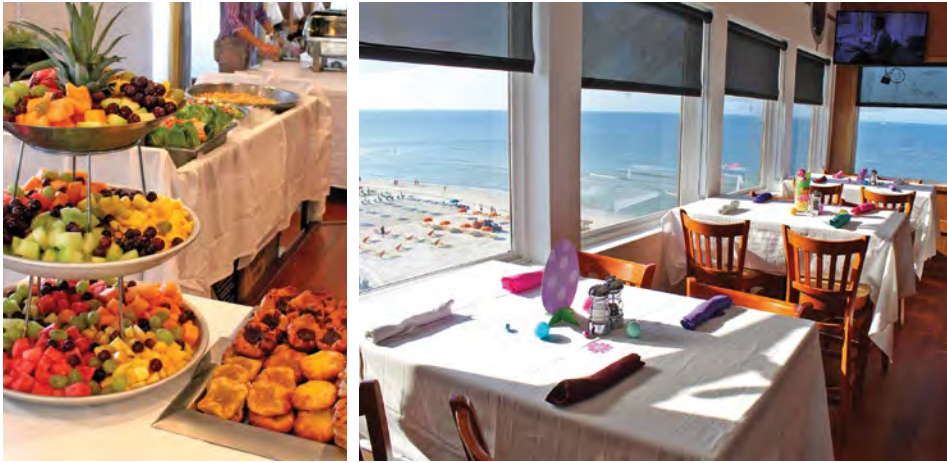
ABOVE: Fresh fruits, salads, pastries and peel-and-eat shrimp grace some of the many bountiful Easter Brunch Buffet items on the Island View’s buffet tables.

Roasted Cod Vesuvio (gluten free),Chicken Piccata