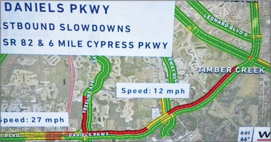
Photo: Typical Wink News Traffic Report For Fort Myer, FL

Very Walkable – Most Errands can be accomplished on foot.