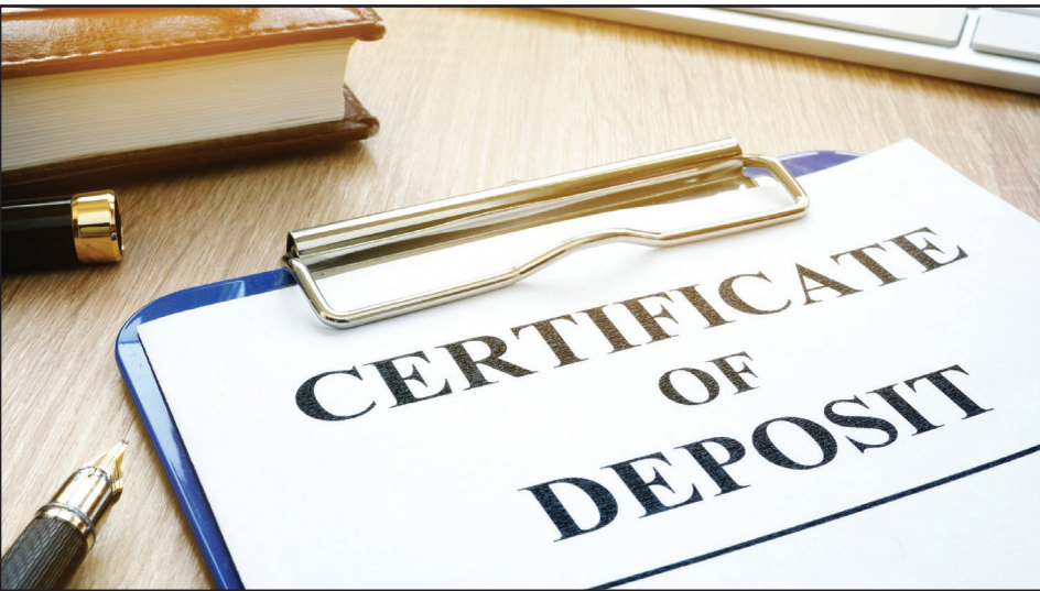
Photo: Certificate of Deposit

While adding individual CDs can be valuable, you might get a greater benefit from a more strategic approach known as laddering. You can build a CD ladder by buying a series of CDs that mature at different dates in the future — perhaps one month, three months, six months, nine months and 12 months out, or an even longer-term ladder of one to five years. In either case, as one CD matures, you can use the money if you need it or reinvest it to another “rung” on your ladder.