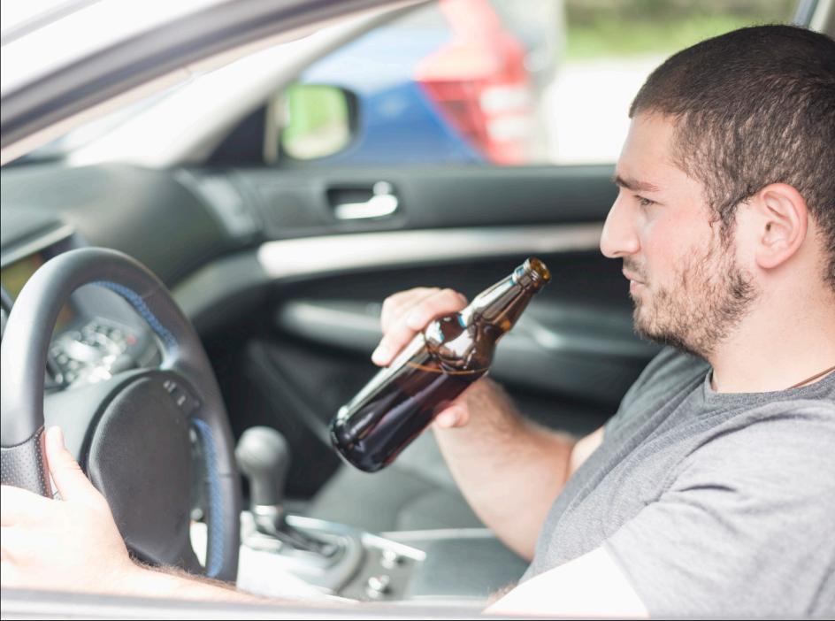
Photo: Adult Male With Beer Driving Car

driver, arranging to be picked up from parties or gatherings, using ride-sharing services, using public transportation or for-hire services such as Uber or Lyft, and walking or staying the night.