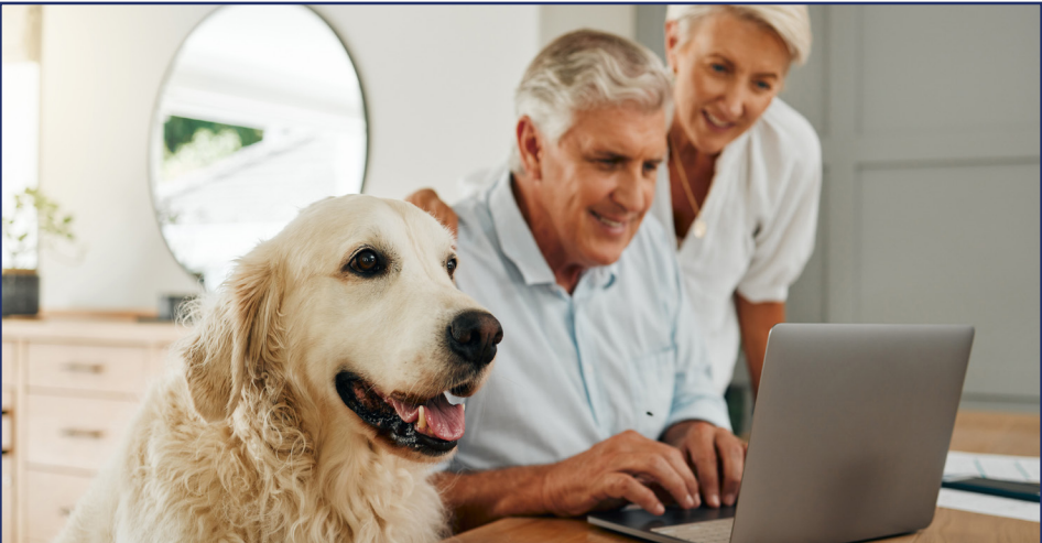
Photo: Couple researching Pet Insurance For Their Pet