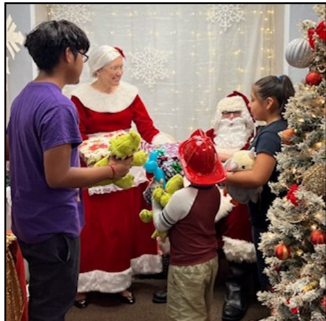
Photo: Two Children Enjoying A Visit With Santa And Mrs. Claus At Childrens Advocacy Centers Toy Shoppe

abuse determination services, pet therapy, therapeutic counseling, parenting education, and prevention programs in Lee, Hendry, Glades, and Charlotte Counties. All services are provided free of charge. For more information, please call 239-939-2808 or visit cac-swfl.org . CAC is a United Way Partner Agency. 🐾