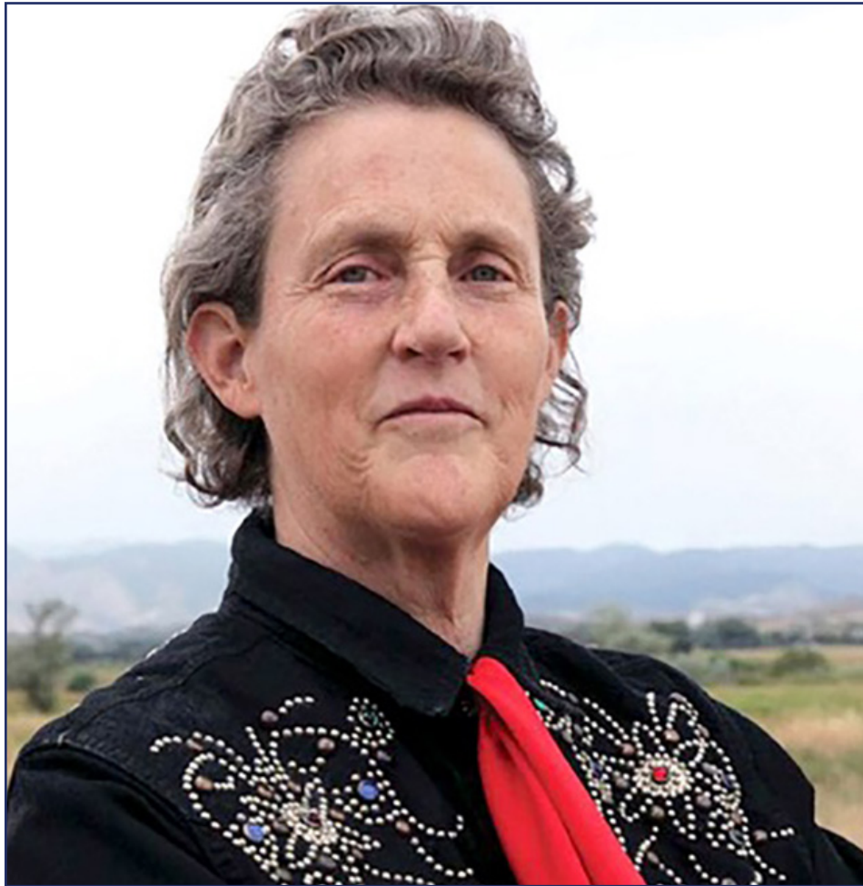
Photo: Autism Activist, Dr. Temple Grandin

serves children from a compassionate, personalized approach through Applied Behavior Analysis (ABA) and Occupational Therapy (OT) services, and offers autism play groups, teen meetings, parent education, community conversations and more. In addition, the organization provides child welfare caregiver training and support through its Family Impact Program. Visit fi-florida.org or find Family Initiative on Facebook and Instagram at @FamilyInitiative and on Twitter at @FI_Inc 🐾