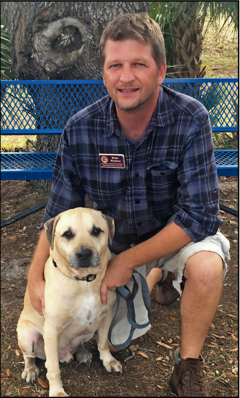
With Dog

and events. For additional information regarding membership opportunities or events, please call 239-332-2930 or visit www.fortmyers.org . For the latest news and updates, follow the Chamber on Facebook at www.facebook.com/gfmcc .